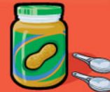
Peanut or nut butters 30 mL (2 Tbsp)