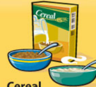
Cereal Cold: 30 g Hot: 175 mL (¾ cup)