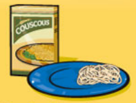
Cooked pasta or couscous 125 mL (½ cup)