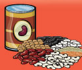
Cooked legumes 175 mL (¾ cup)