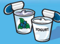
Yogurt 175 g (¾ cup)