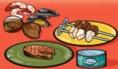
Cooked fish, shellfish, poultry, lean meat 75 g (2 ½ oz.)/125 mL (½ cup)