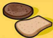
Bread 1 slice (35 g)