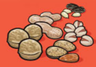
Shelled nuts and seeds 60 mL (¼ cup)