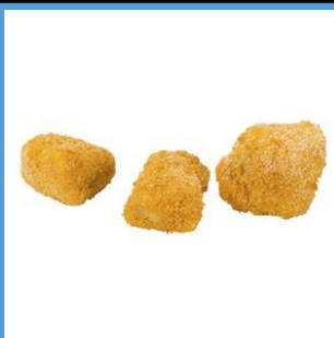
6566053 Cod Nugget approx 150 pcs