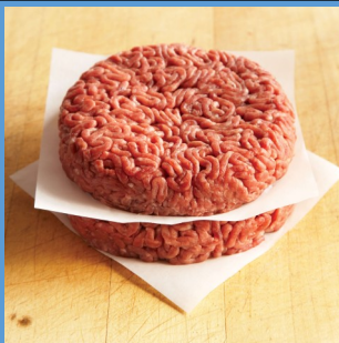
1324213 4oz Beef Burgers Butcher Style 36-pcs