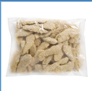
1815907 Chicken finger filet approx. 90 pcs