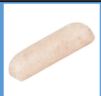
8836041 Large Breakfast Sausage approx 60 pcs