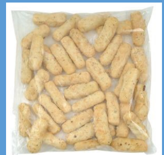
9029026 Mozza Sticks approx. 55 pcs