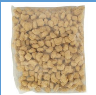
6237881 Popcorn Chicken approx. 400pcs