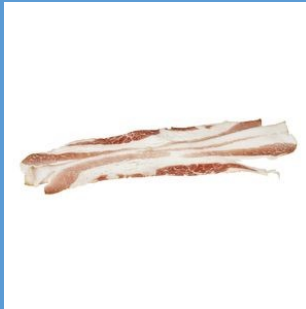
2936005 5Kg—Fresh Bacon Restaurant Style