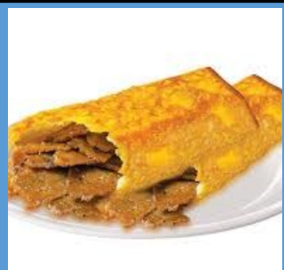
1338898 Donair Eggroll 80 pcs