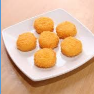
0245043 Breaded Scallop approx 125 pcs