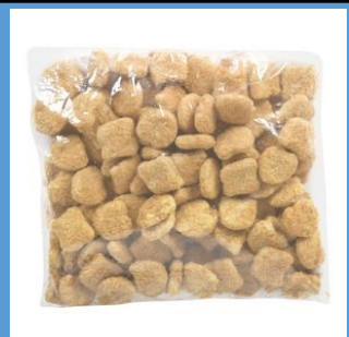
0135004 Chicken Nuggets approx 200 pcs