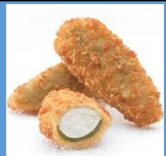
6328332 Jalapeno poppers 65 pcs