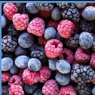
4037986 Indv. Froz Blue, black, Staw & Rasp 5kg