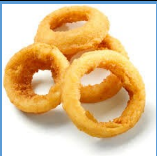
9601501 Onion Rings 4kg