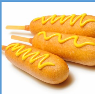
3048451 POGO-Corn dog 50 pcs