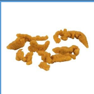
4245718 Clam Strips 24 x 4oz bags